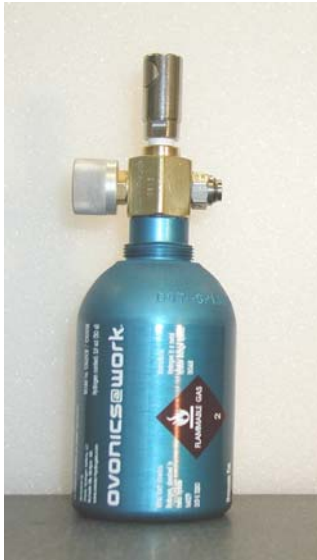
Shown with optional quick-connect coupling. Actual appearance may vary.